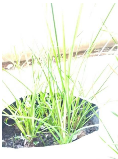
Figure 1. Vetiver grass

Wetland vegetation: The plants have an important role in wetlands. They should be able to adapt to waterlogged conditions, local climatic conditions, resistant to high pollutant minerals. They help in releasing oxygen by photosynthesis, reduce the velocity of inflow water thereby improving sedimentation of suspended solids, hydraulic conductivity of substrate and uptake of nutrients. In SSF wetlands, plants interact with wastewater at root zone only. The roots provide large surface area for the growth of microorganisms and bacterial colonies, forming a biofilm which is attached to the surface of substrate articles and roots. The hydraulic conductivity of the substrate is maintained by the root system. The common plants used are Common Reed, Cattail, Bullrush, Vetiver and Heliconia. Vetiver is a native medicinal plant of India. It has fibrous root system and has high resistance to polluted conditions. It has a unique property to grow in harsh conditions and absorb the contaminants leading to bioremediation.